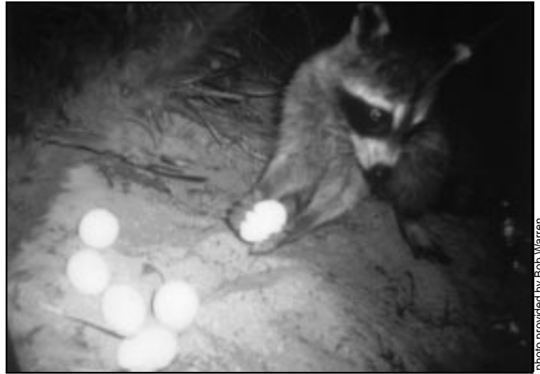
A raccoon captures himself on film looting eggs from a "dummy" sea turtle nest spiked with chicken eggs.

Though slightly more expensive and labor-intensive than lethal control, nest screens were the only method to control wide-spread nest depredation. The 3 ft. x 3 ft. mesh screens have openings about 2 inches x 9 inches – small enough to discourage raccoons, but large enough to let turtle hatchlings emerge. Researchers stretched the screens over the nests, securing them with 3 ft. rebar pounded