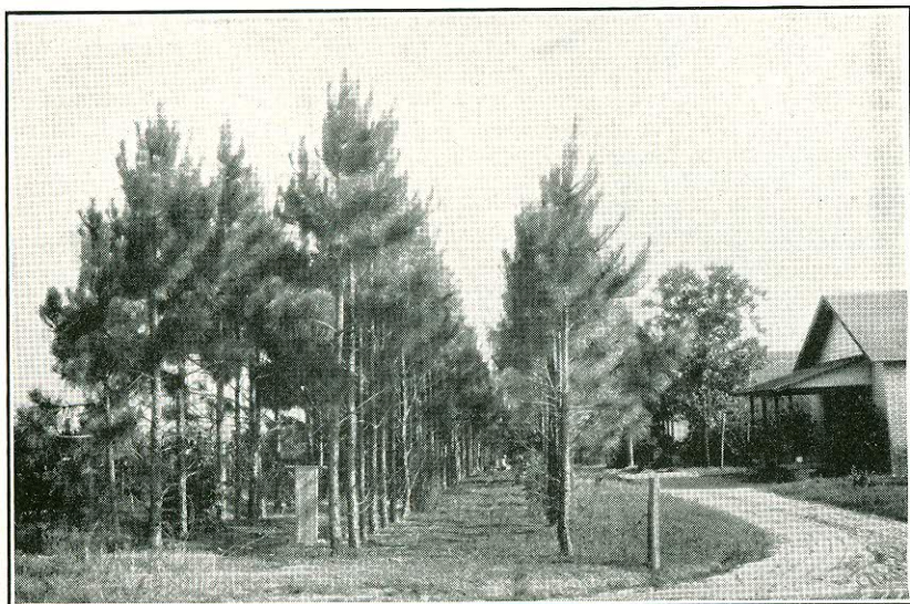
Slash pines transplanted January 1927.