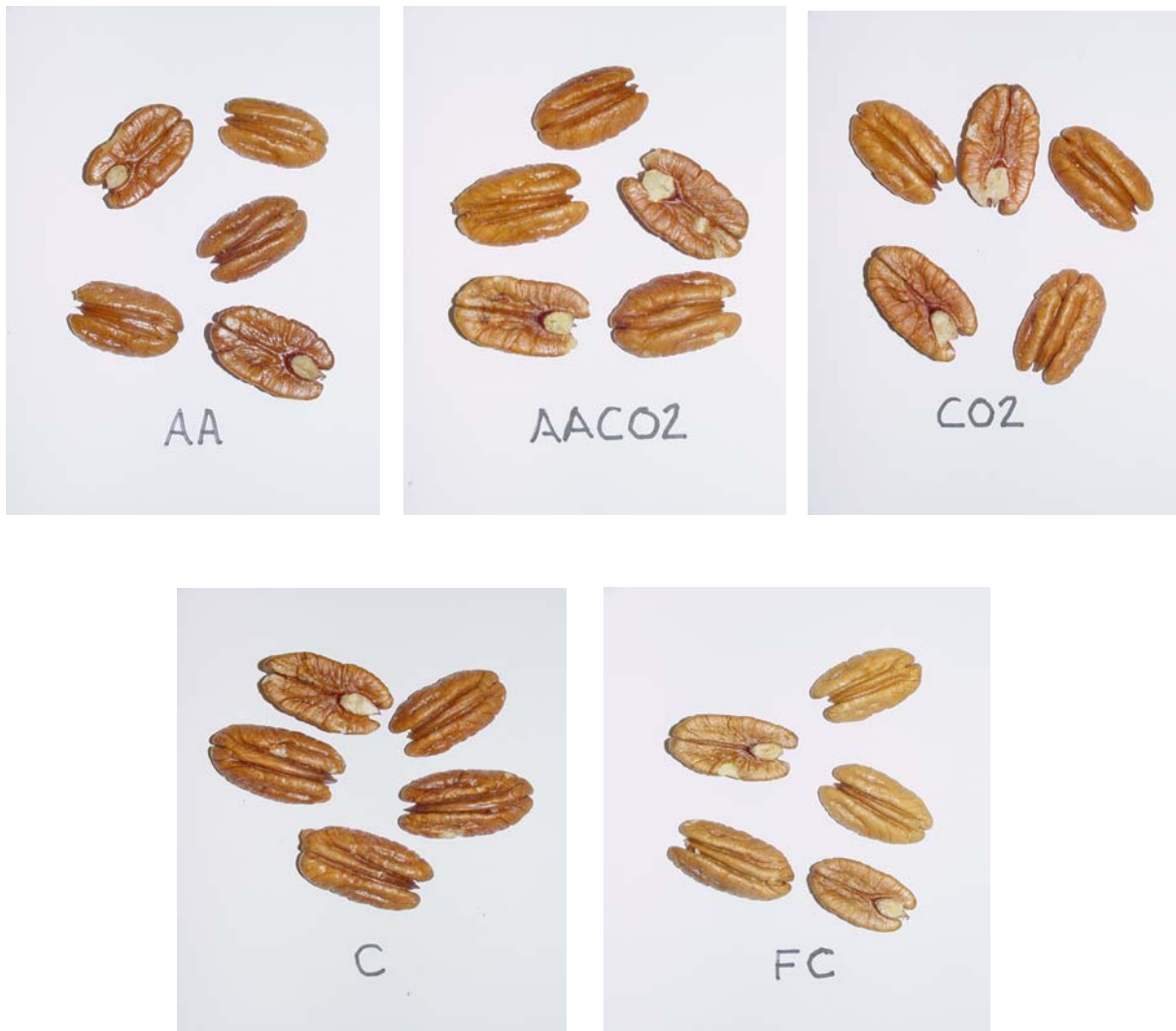
Table 3: COLOR AND APPEARANCE OF THE TREATED PECANS AFTER 6 MONTHS OF STORAGE

the other samples. It was also interesting that even the untreated control sample (C) that was held at room temperature did not change significantly in appearance with only a slight overall darkening and the development of some subtle darker “stripes” in certain areas which are difficult to see in Table 3. There are samples of each treatment still being held in the Department of Food Science at the University of Georgia, and the appearance changes will be monitored again at 9 and 12 months of storage later this year.