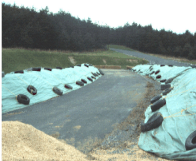
Figure 1. Composting mortality windrows covered with a water-repelling compost fleece. If discarded tires are used to anchor the fleece in place, they should be cut in such a way that they do not retain rainwater.

If flock repopulation time schedules permit, forming windrows within the poultry house or litter shed is the ideal location for composting, with a level, firm base and protection from rainwater. If an under-roof site is not available, find a site that is well-drained, out of the flood plain, relatively free of rocks, accessible to machinery, and located away from areas of running or standing water. A temporary ground liner can prevent any potential leaching from the windrow. Bear in mind that the liner can cause difficulties with spreading equipment, as it will likely be torn during removal of the windrow. Temporary concrete barriers commonly used with highway construction projects or large hay bales have been successfully used to create a channel for compost containment. Protect open air piles from prolonged contact with rainwater with a covering that repels water, such as composting fleece or a plastic tarpaulin. Figure 1 illustrates the use of a composting fleece. A well-rounded windrow also will aid the shedding of rainwater.